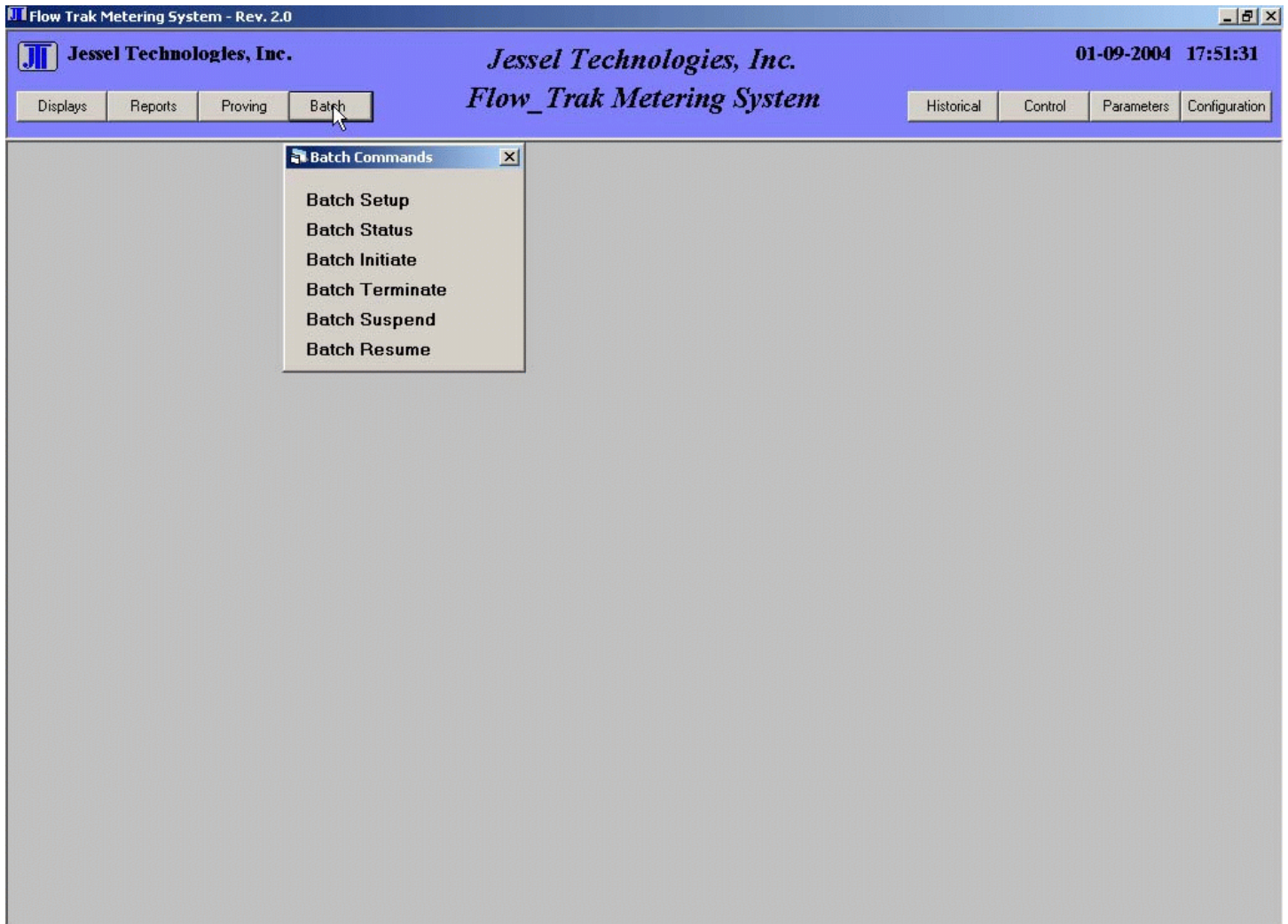
Figure 1 Batch Selection Menu

The batch button allows the operator to initiate and monitor batch activity. Depending on a configuration of the system, batch information may be presented by individual meter or by groups.