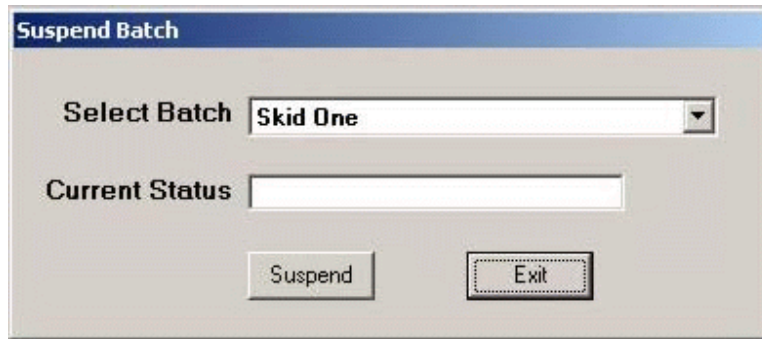
Figure 10 Batch Suspend Display

When it is necessary to stop a batch, but not reset the batch total, the batch suspend command may be used. This command will either close the inlet and outlet valves to cease flow through the meter runs. If the meter runs have flow control valves that are sealing, configured in the meter setup displays, then the system will command the valves to a zero output. Clicking the apply button issues the command to the system to suspend the batch.