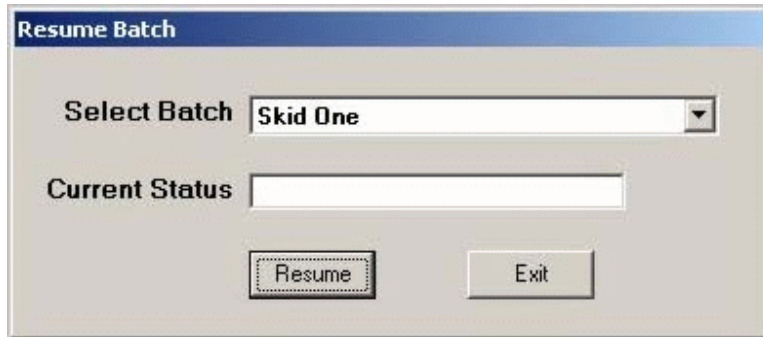
Figure 11 Batch Resume Display

After suspending a batch, it is restarted by issuing the batch resume command, the batch will resume flow and continue from where it was suspended for all totals. If the valves were closed, then they will open again, or if the flow control valves were utilized to suspend flow, a new set point will be given to resume flow. Clicking the apply button issues the command to the system to resume the batch.